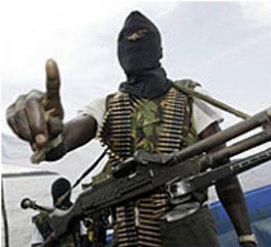
In Nigeria, militants and politicians fight for control of 60 percent of oil revenue, instead of for control of the technology that will yield double the nation's revenue. [Original Caption: Nigerian militants in open-hulled boats attacked an oil rig of Royal Dutch Shell more than 100km from land.]