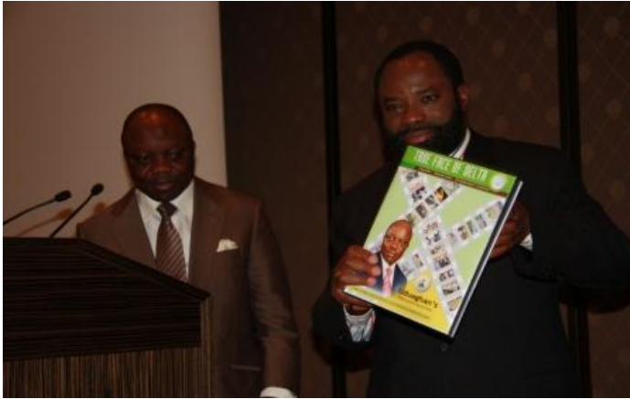
Prof. Emeagwali (right) displays a souvenir of the True Face of Delta presented to him by Gov. Uduaghan at the Delta Diaspora Direct (D3) summit held in Geneva, Switzerland