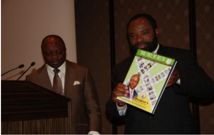
Gov. Uduaghan watches as Prof. Emeagwali displays a memorabilia on Delta State presented to him after his captivating address in Geneva, Switzerland.