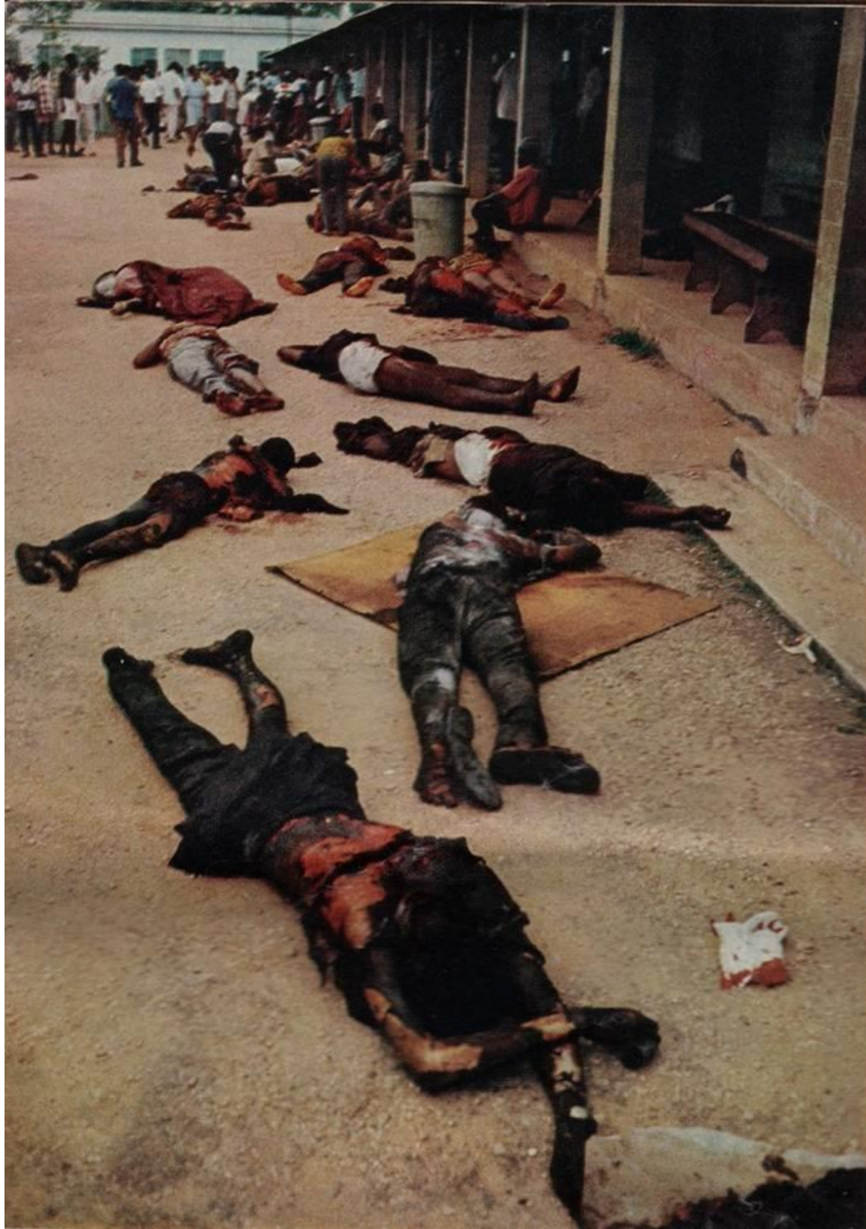
Egyptian pilots flew Soviet Jets that blasted several homes in Emeagwali's neighborhood.