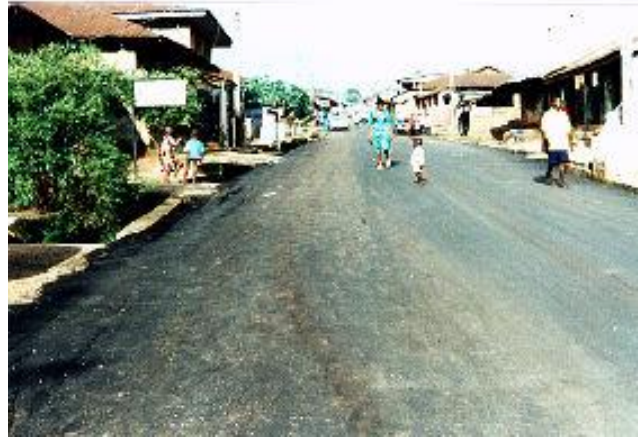
A circa 2007 photo of Gbenoba Road.

This photo was taken at 6C Wilkinson Road, Onitsha, circa 1955, during the ceremony of her initiation into the Otu Odu (Ivory Society), the most prominent women organization in Onitsha.