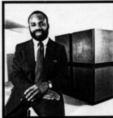
Dr. Philip Emeagwali

That was three times the speed of the fastest supercomputers of the day – at one-fifth the cost.