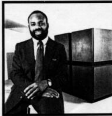
Dr. Philip Emeagwali

That was three times the speed of the fastest supercomputers of the day – at one-fifth the cost.