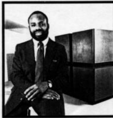
Dr. Philip Emeagwali

That was three times the speed of the fastest supercomputers of the day – at one-fifth the cost.