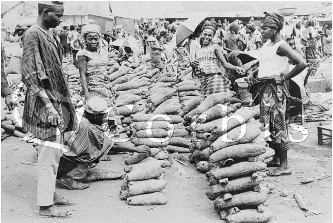
Customers Observing Yams at Onitsha Market

Original Caption: Nigeria--Fighting for Peace. The market at Onitsha is open once more and prospective customers inspect an enormous pile of yams. Date Photographed: April 25, 1970 Location Information: Onitsha, Nigeria