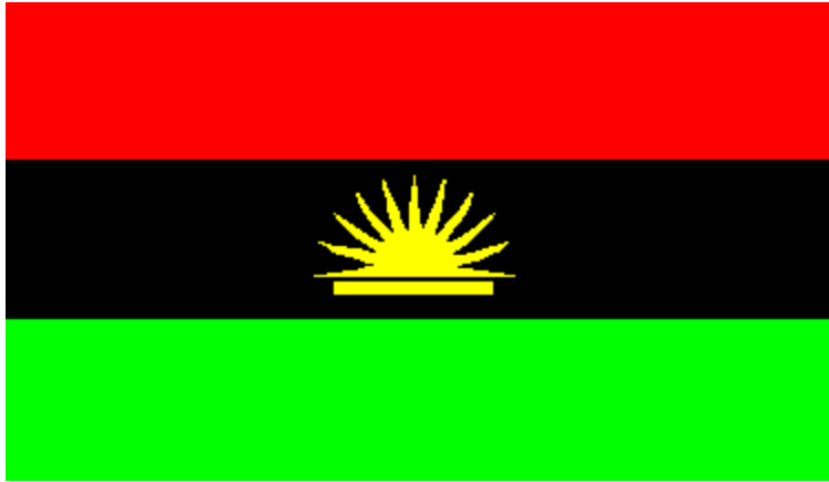
The Biafran Flag