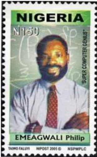
Postage Stamps Honor Supercomputer Genius

"I have never come across such a speech concentrated on solving the problems of Africa." - Aster Sagai, London